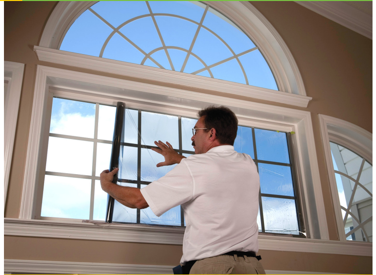
Surface-applied window films can be installed by do-it-yourselfers, but professional installation is recommended. After thorough and specialized cleaning, the installer will apply a solution to the window surface prior to rolling and squeegeeing the film.

Window films can be professionally applied by a skilled installer or are available for do-it-yourself projects at home improvement stores. Films are typically about 2–7 mils thick (50–175 microns) and come on rolls 36 to 72 inches (1–2 meters) wide. Films have a minimum of three layers: a pressure-sensitive or water-activated clear adhesive layer (against the glass), a polyester film layer, and a scratch-resistant coating. Films for safety/security function will be substantially thicker. A variety of other technologies that tune the film for different performance properties can be added to this basic configuration: tints, low-emissivity (low-e) coatings, and UV radiation