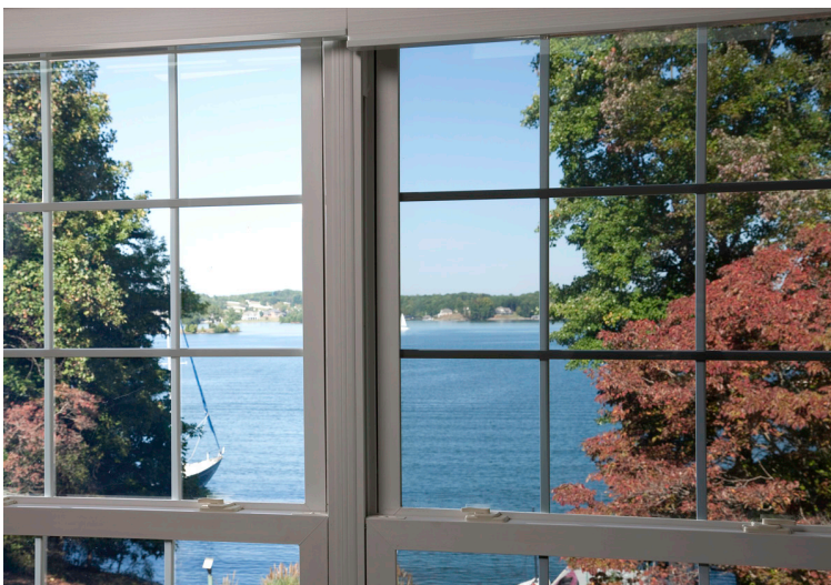
The window on the left has no film; the window on the right does. How much a film alters the appearance of the window (inside and out) depends on a number of variables and is difficult to generalize because there are currently so many different films.